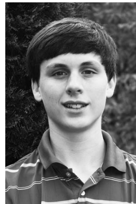
Silver Falls School District

"What this quote means to me is to not let people's opinions of me matter," he said. "I have struggled with what people thought of me and when I missed a shot in basketball, I worried what people would think. I would have made more shots if I didn't let people's opinions get in the way."